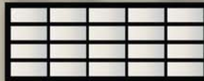
18'-0" x 7'-0" 4-Section, 5-Panel