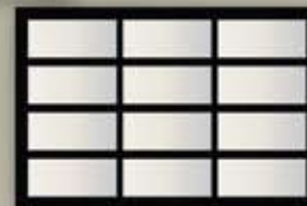
12'-0" x 8'-0" 4-Section, 3-Panel