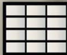
10'-0" x 8'-0" 4-Section, 3-Panel