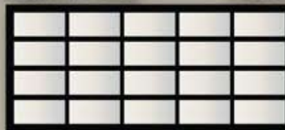
18'-0" x 8'-0" 4-Section, 5-Panel

★ Non-Standard panel arrangements are available to meet your specific requirements.