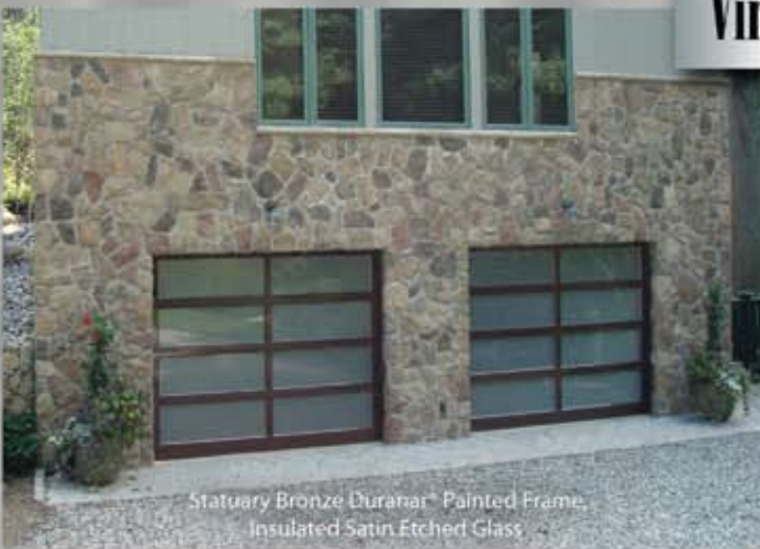
Statuary Bronze Duranar™ Painted Frame, Insulated Satin Etched Glass

Panel widths and heights can be configured to meet your design requirements. You can choose from glass or aluminum panels, painted or with an anodized finish, regardless of your choices the beauty of the Modern Classic will last a lifetime.