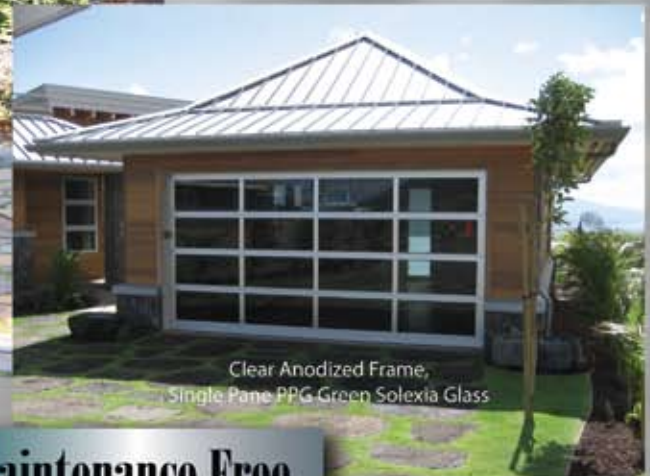
Clear Anodized Frame, Single Pane PPG Green Solexia Glass

Now you can have the stylish appeal of a sleek and architecturally refined garage door, the Modern Classic.