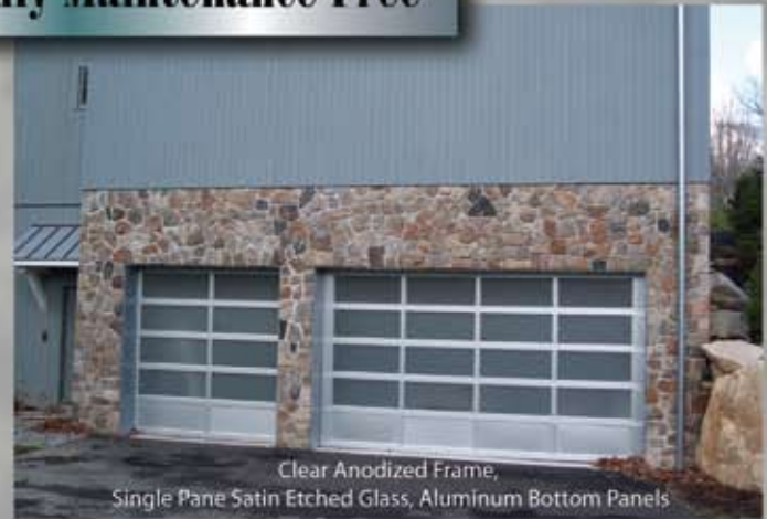
Clear Anodized Frame, Single Pane Satin Etched Glass, Aluminum Bottom Panels

Panel widths and heights can be configured to meet your design requirements. You can choose from glass or aluminum panels, painted or with an anodized finish, regardless of your choices the beauty of the Modern Classic will last a lifetime.