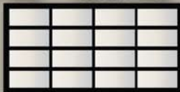
16'-0" x 8'-0" 4-Section, 4-Panel