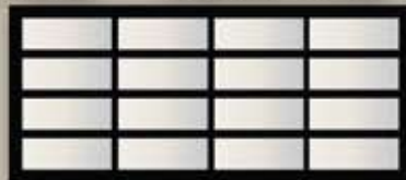
16'-0" x 7'-0" 4-Section, 4-Panel