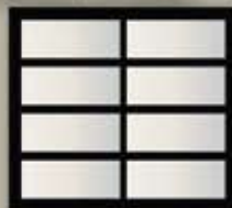
9'-0" x 8'-0" 4-Section, 2-Panel