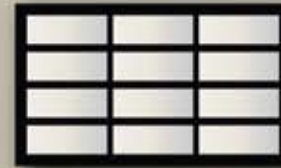
12'-0" x 7'-0" 4-Section, 3-Panel