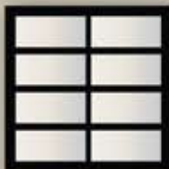
8'-0" x 8'-0" 4-Section, 2-Panel