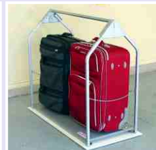
Luggage and Trunks