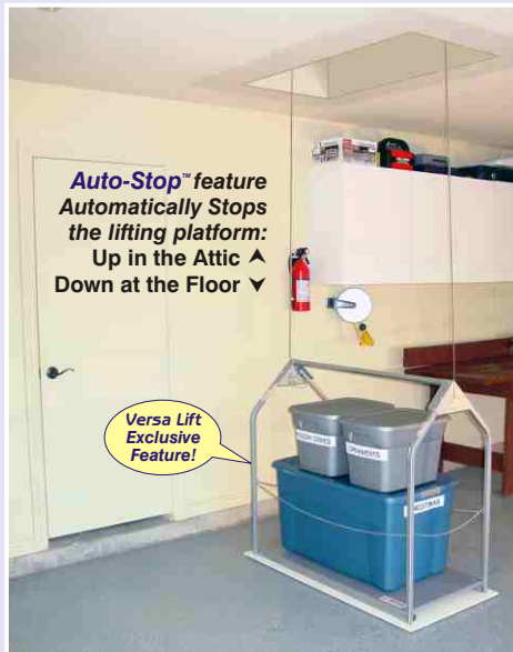
Auto-Stop TM feature Automatically Stops the lifting platform: Up in the Attic ▲ Down at the Floor ▼

Versa Lift Auto-Close TM seals the ceiling opening and auto-adjusts for joist heights up to 18".