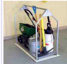
Spreaders, Sprayers, Shovels