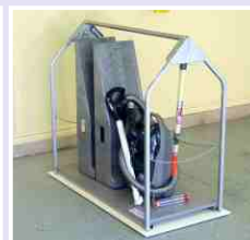
Auto Ramps and Tools