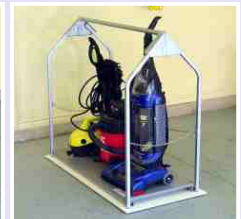
Pressure Washer, Vacuums