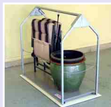
Lawn Chairs, Planter Pots