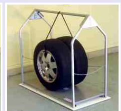
Wheels & Tires

Versa Lift™ - the Award-Winning Utility Lifting System for Home or Business!