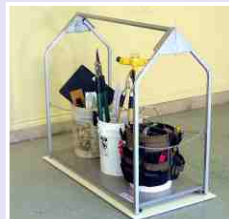
Tool Buckets, Pruners, Etc.