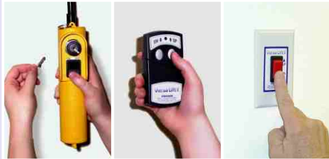
Standard corded remote w/lock Wireless remote control Wall mounted 24V switches

The Versa Lift's unique Level-Up TM system closes the ceiling port while raising the platform flush with the upper floor, so you can just slide cargo on or off the platform! Versa Lift installs in a new framed opening like the one used for a folding attic ladder.