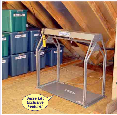
Versa Lift Exclusive Feature!

Versa Lift Level-Up TM feature brings the platform flush to attic floor, so cargo slides on and off!