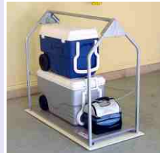
Ice Chests, Camping Gear

Hundreds of items can be stored out of sight with Versa Lift! ▼