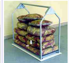
Pool & Patio Cushions