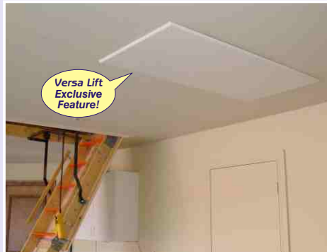
Versa Lift Exclusive Feature!

Versa Lift Level-Up TM feature brings the platform flush to attic floor, so cargo slides on and off!