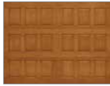
Vertical Raised Panel 7' high