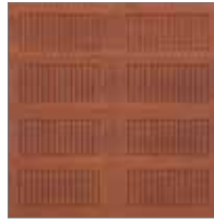
Sonoma Panel 8' high