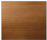
Horizontal V-Groove Panel 7' high