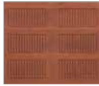
Sonoma Panel 7' high