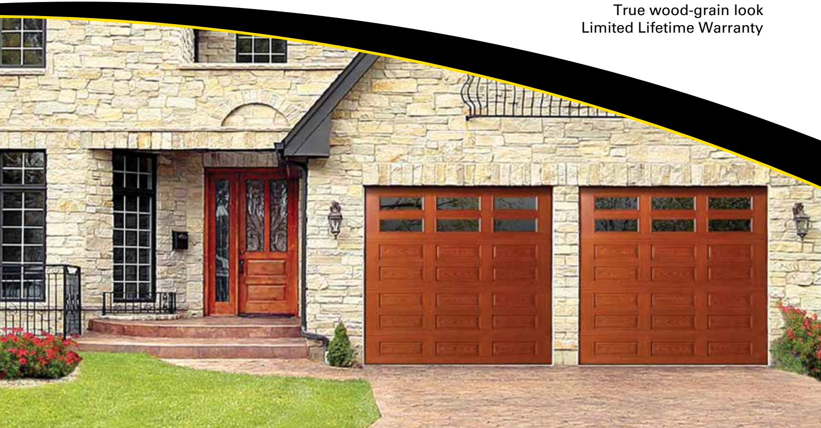
8' Horizontal Raised panel, Oak finish, clear glass