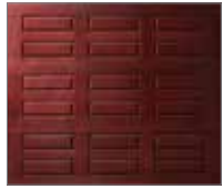
Horizontal Raised Panel 7' high