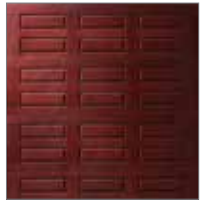
Horizontal Raised Panel 8' high