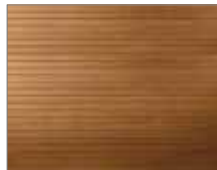
Horizontal V-Groove Panel 8' high

Larger sized doors are available (up to 14' high and 18' wide) depending on panel style.