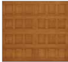
Vertical Raised Panel 8' high